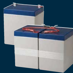
B-12-5 / B-24-5 Lead Acid Battery