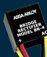
BR-4 Bridge Rectifier