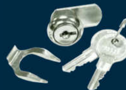
CKL Cabinet Key Lock